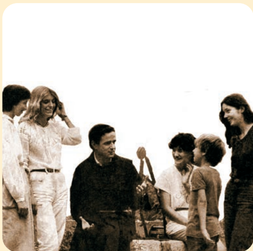
Five visionaries with Father Jozo, July 1981 © Glas Mira Medjugorje, March 2003

“My children, don’t you recognize the signs of the times? Do you not speak of them? Come follow me. As a mother I am calling you!”